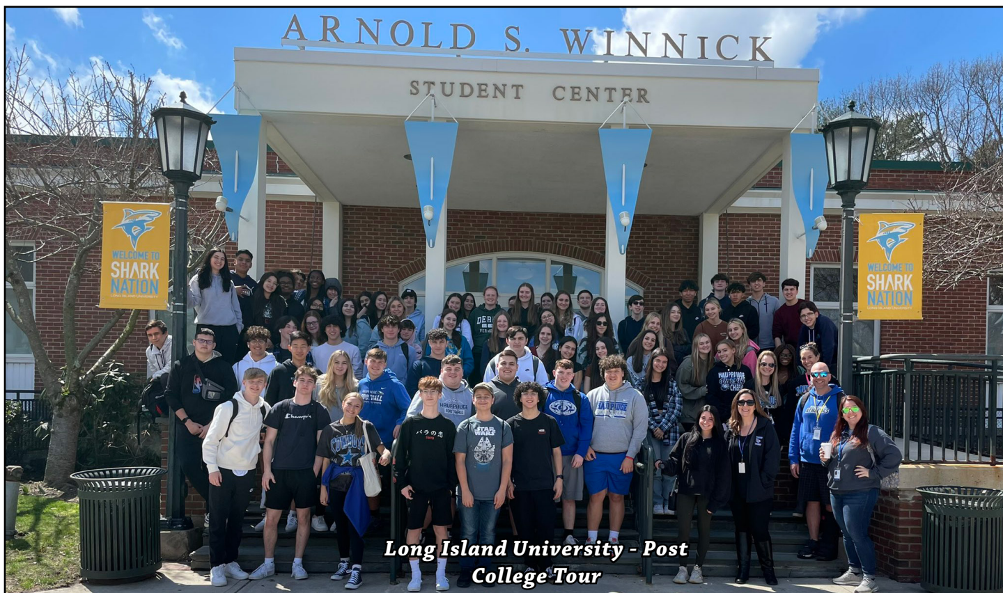
Long Island University - Post College Tour